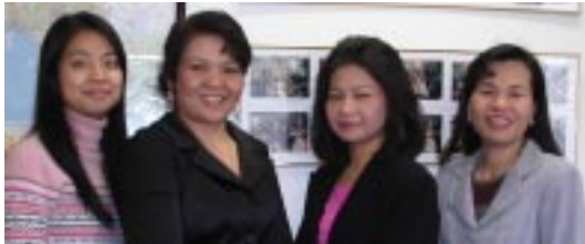
Cambodian Women's Association

Decisions were difficult, since applicants included agencies that provide culturally relevant health services, empower and build leadership among young girls and teenagers, and provide resources to parents and early-learning child care programs.