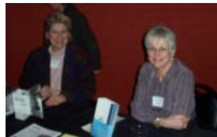
WFA agencies tell their stories at the Rep.

and good spirits, agency staff and volunteers explained how they are making this area a better place for women and girls, and how the Alliance helps make their work possible. One supporter said she “really didn’t understand the breadth of what WFA does until I saw so many agencies in one place!”