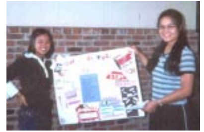
Young Women's Leadership Group of the Asian and Pacific Islander Family Safety Center

To the Ripple Fund members and donors—thank you for starting a new wave of change! Your time, commitment and passion for the women and girls in our community have inspired us all.