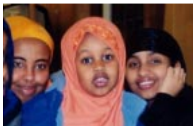
Somali Women & Children Skills For Change

In the fall of 2003, a group of friends came together and discussed the age-old tradition of shared giving and women's giving circles. They were inspired by their commitment to women and girls, and to learning, giving, and personally