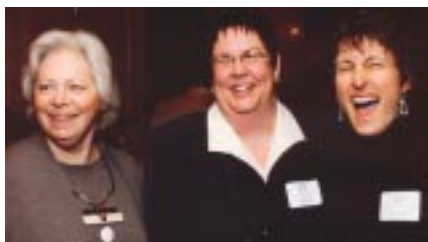
Guests enjoy themselves at the Art of Dining.

This year's Art of Dining will take place at the Paramount Theatre on Thursday, April 22 . The evening features an elegant multi-course dinner prepared by a dozen of Seattle's most beloved women chefs, as well as an auction that showcases art from two dozen of the Northwest's best-known women artists. Last year, the event drew 480 guests and raised more than $200,000 to improve the lives of women and girls!