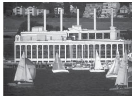
ZymoGenetics' historic headquarters on Lake Union

ZymoGenetics is an independent biopharmaceutical company founded in Seattle in 1981, with its headquarters in the historic Lake Union Steam Plant and neighboring buildings on the south shore of Lake Union. The company and its 350 employees have a long history of community involvement, providing summer internships for students, science mentoring programs, a company charity auction, and much more.