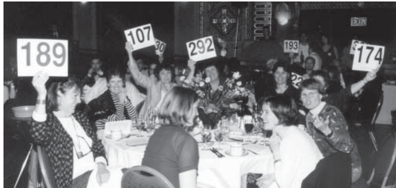
AOD guests raise bid cards and dollars to benefit women and girls!

Roasted garlic crab, ginger-crusted halibut, and chocolate truffles—these are just some of the tasty delights enjoyed by the 350 guests at WFA’s Art of Dining this year! The elegant evening at Seattle’s beautiful Paramount Theatre featured a meal created by a team of 14 female celebrity chefs, as well as an auction showcasing art from 31 Pacific Northwest women artists. The event raised $175,000 to benefit the lives of women and girls , and more than 50 volunteers offered helping hands on the day of the gala. Thank you!